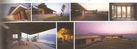
Opolis, Model Colony, Pune