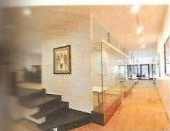
Shivaji Park - Planning Spaces, Mumbai